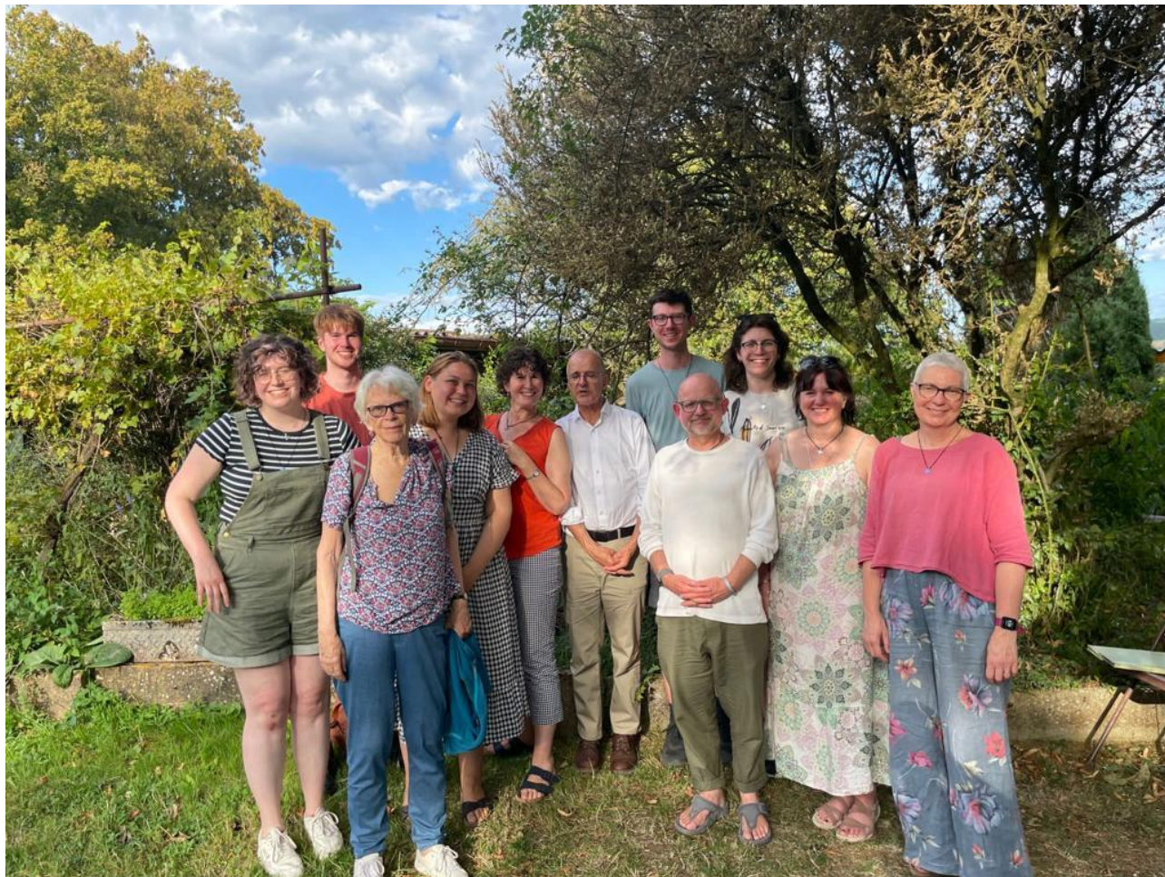
Two of our church families on pilgrimage in France.